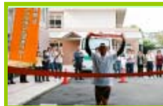
He ran 153km from Oyama city to CRC in Yokohama... ( ^_^ ) / wow !!

A "tasuki" is a belt hanged from a shoulder to the other waist, and is often used to identify the relay/marathon runner in Japan. We are enlightening Child Abuse and Neglect Prevention(CANP) through passing this tasuki colored in the symbolic color of CANP; orange , by marathon. It was the 4 th Shonan · Tokyo Orange Ribbon Tasuki Relay this year. There was a typhoon heading to Tokyo area on the day, and we were concerned we might have to suspend the relay... Fortunately, we were able to make the Typhoon swerve with our guts (!?), and passed the Tasuki on Oct 31 st . This year, a runner who works at a children's home ran 153km from Oyama city , the origin of Orange Ribbon Campaign, and passed the Tasuki to us. Our relay had two courses, the Shonan course starting from Yurikago Children's Home, Odawara, and the Tokyo course starting from "Hachi" statute , Shibuya (we put the tasuki on "Hachi"!)). The 190 runners who ran on the 31 st (Sun) were surely multidisciplinary: child welfare professionals, general publics, school teachers, business men and etc. We handed out 10000 handmade orange ribbons , had music and panel discussion events at the halfway point Tokyo Tower, and the goal Yamashita Park. We appealed CANP to lots of people including the 20,000 people visited Yamashita Park that day!! Now the Tasuki is passed to Gifu, where the next Tasuki Relay was held on Nov. 14 th .