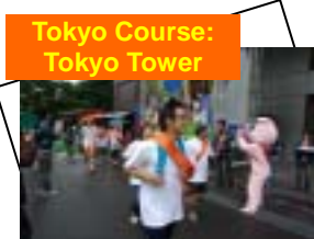
Tokyo Course: Tokyo Tower